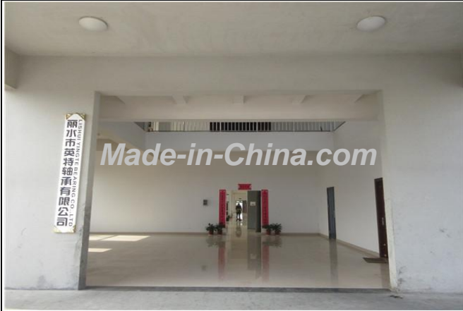
Description: Company Gate